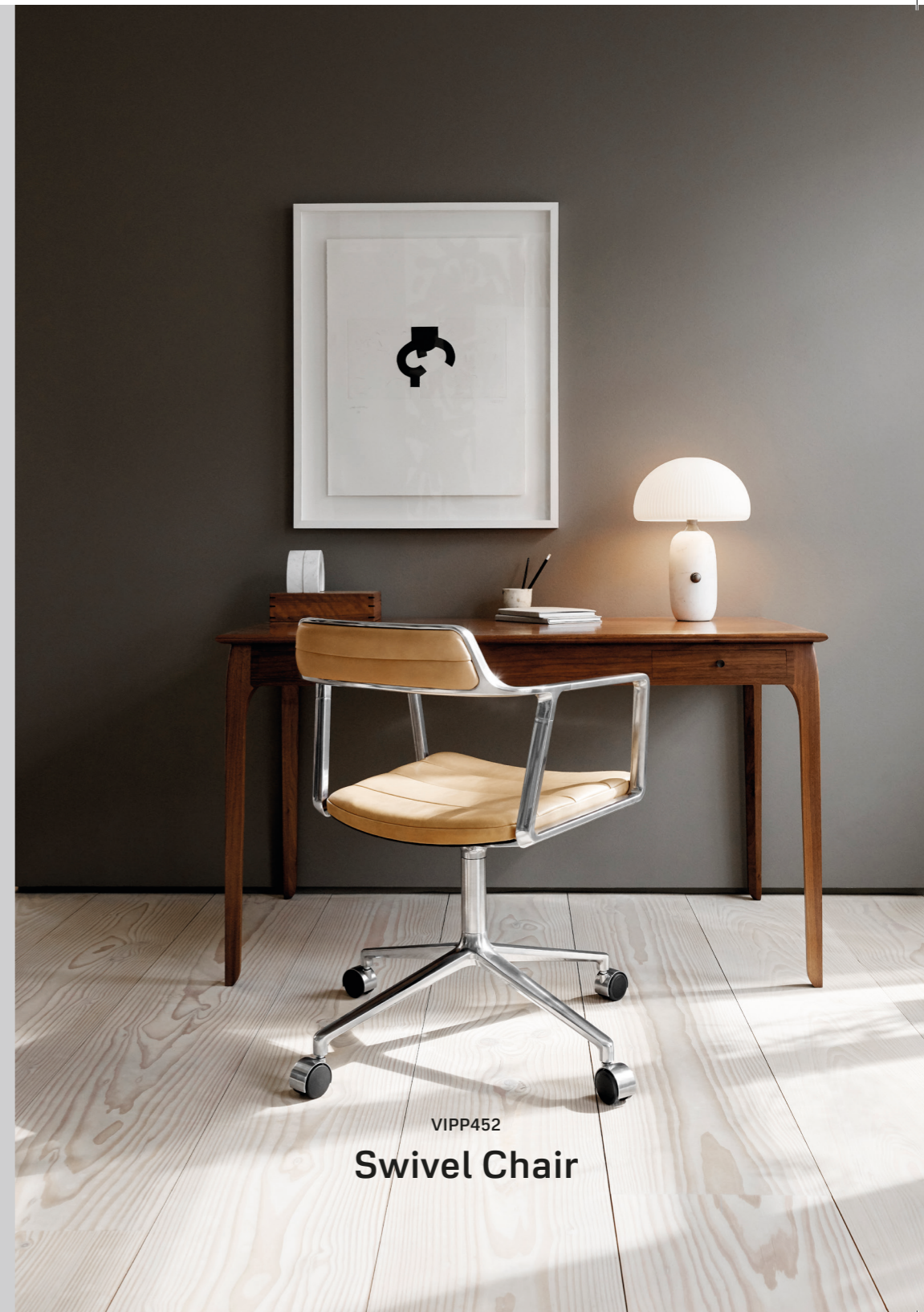
VIPP452 Swivel Chair